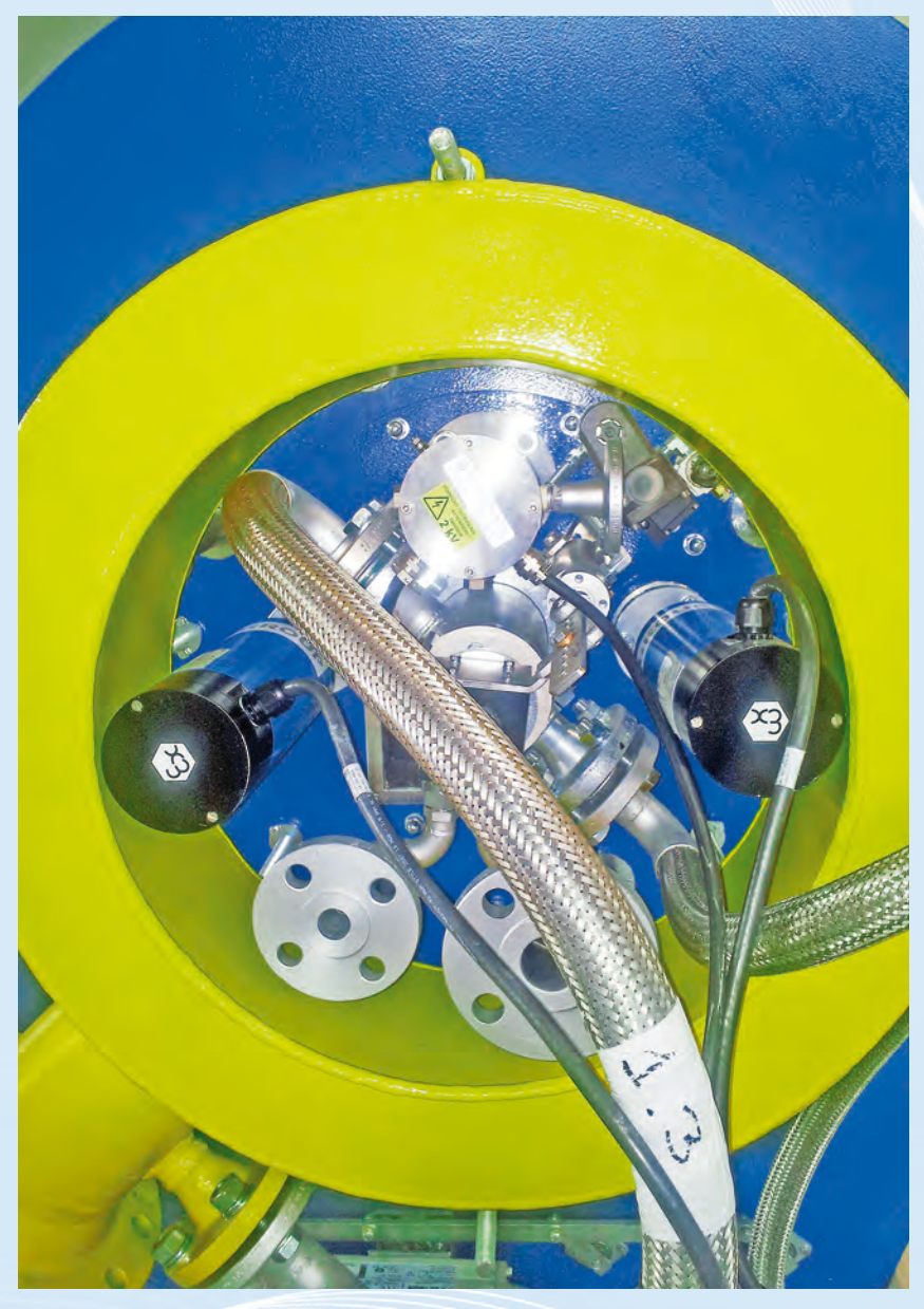
MIXED NATURAL GAS-FUEL OIL BURNER MODEL JBD-50,000—GFO WITH VAPOUR ATOMIZATION FOR ZONE 1 WITH EQUIPMENT WITH EEXD CLASSIFICATION FOR THE REPSOL – TARRAGONA REFINERY.

An explosion produces a rapid combustion, heat, noise and pressure wave due to the expansion of the gases that are produced.